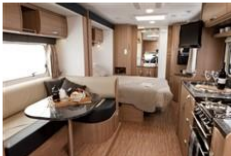
IVECO DAILY SERIES IV.28-1